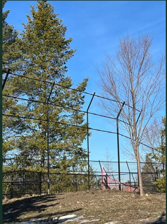
February 2023 - Phase 1 of the habitat expansion includes new fencing.

Funds from this campaign were split, with 50% supporting the Zoos Amur tiger habitat expansion and 50% supporting the Tiger SSP Conservation Campaign. This organization supports three endangered tiger species, including Amur and Sumatran, and raises awareness about wild tigers. The tigers at your Toronto Zoo engage visitors daily, raising awareness and funding for their wild counterparts.